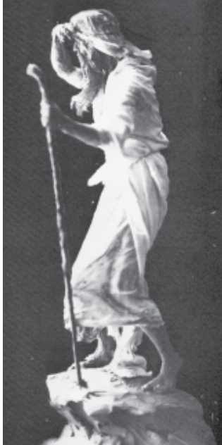
Moses on Mount Nebo Israel Museum Collection